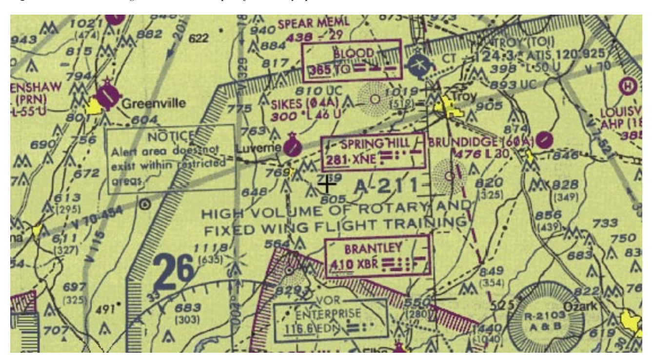
Figure 14-6. Alert area ( A-211 ).