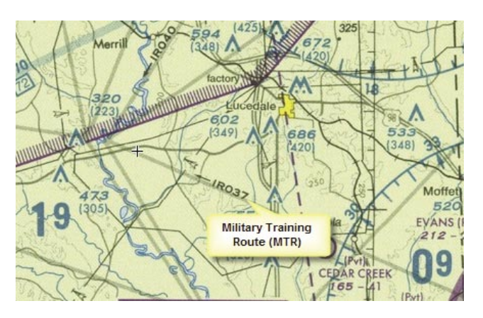
Figure 14-7. Military training route (MTR) chart symbols.

MTRs are routes used by military aircraft to maintain proficiency in tactical flying. These routes are usually established below 10,000 feet MSL for operations at speeds in excess of 250 knots. Some route segments may be defined at higher altitudes for purposes of route continuity. Routes are identified as IFR (IR), and VFR (VR), followed by a number. [Figure 14-7] MTRs with no segment above 1,500 feet AGL are identified by four number characters (e.g., IR1206, VR1207). MTRs that include one or more segments above 1,500 feet AGL are identified by three number characters (e.g., IR206, VR207). IFR low altitude en route charts depict all IR routes and all VR routes that accommodate operations above 1,500 feet AGL. IR routes are conducted in accordance with IFR regardless of weather conditions. VFR sectional charts depict military training activities such as IR, VR, MOA, restricted area, warning area, and alert area information.