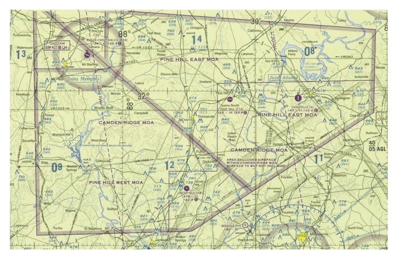
Figure 14-5. Camden Ridge MOA is an example of a military operations area.