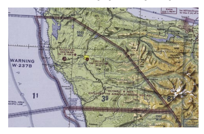
Figure 14-4. Requirements for airspace operations.

MOAs consist of airspace with defined vertical and lateral limits established for the purpose of separating certain